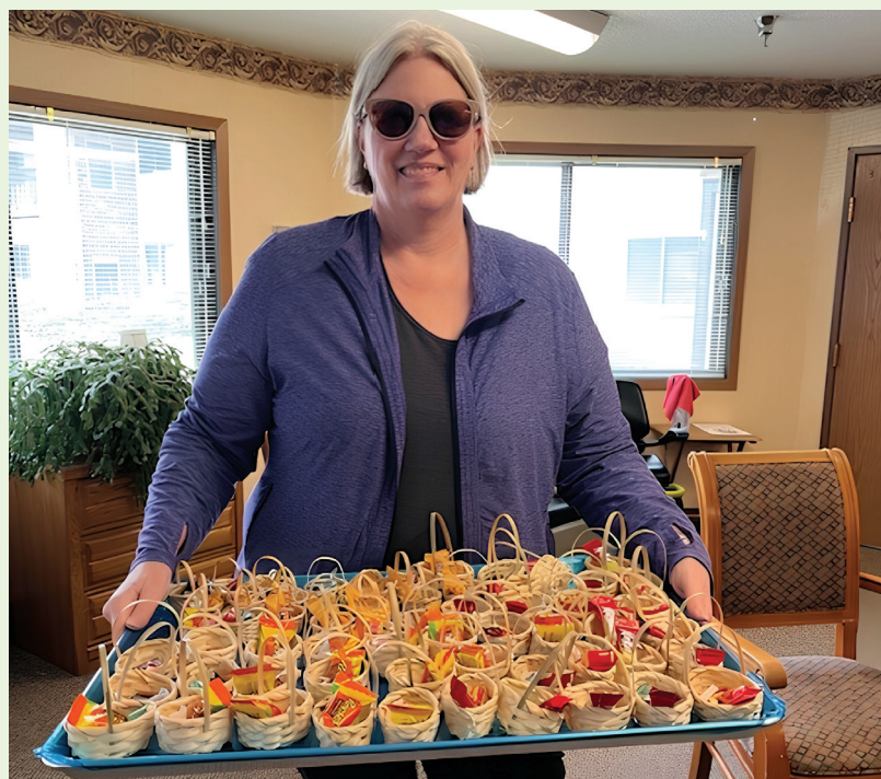
Volunteers and supporters like Jolene create connections.

Volunteers and donors like you make meaningful moments possible!