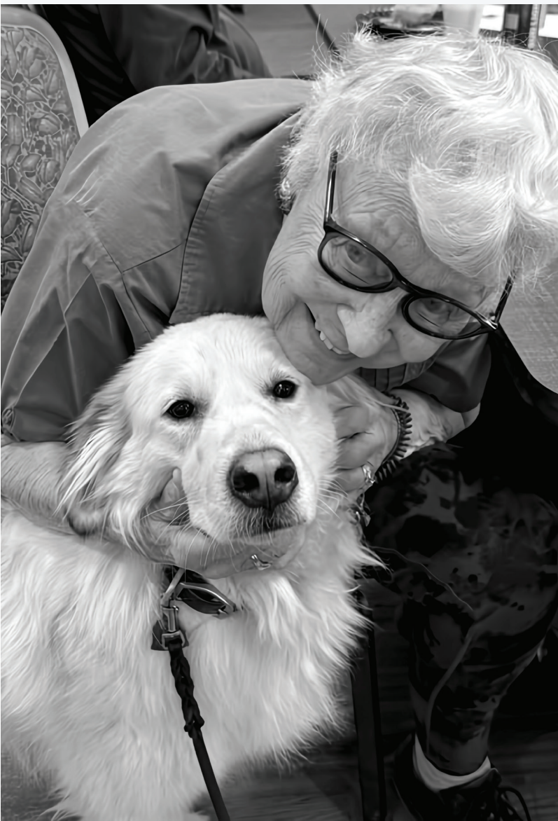
Bella's visits bring comfort and smiles!